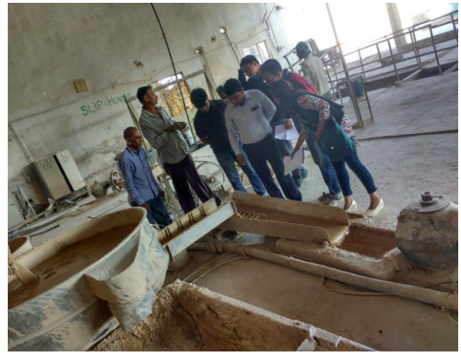
Exhibit II: Moulding process