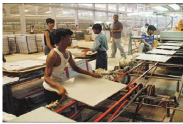
Exhibit IV: Anti-dumping duty makes Gujarat's Morbi ceramics sparkle [Times of India Report, 1st April 2016]

Ahmedabad: The anti-dumping duty on all types of vitrified tiles from China has come as a breather for the local ceramic industry, which was facing stiff competition from cheap Chinese imports. To protect local ceramic industry, government has imposed anti-dumping duty of $1.37 per square meter on vitrified tiles from China.